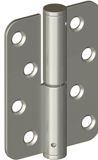
Dimensions drawing (DIM)