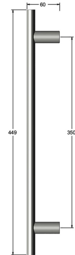
Dimensions drawing (DIM)