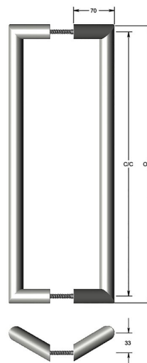
Dimensions drawing (DIM)