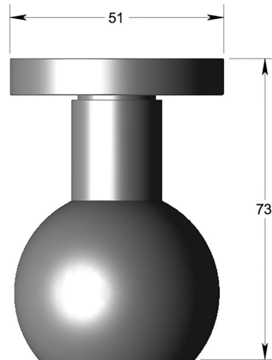
Dimensions drawing (DIM)