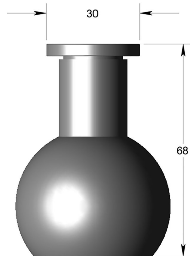
Dimensions drawing (DIM)