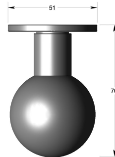
Dimensions drawing (DIM)